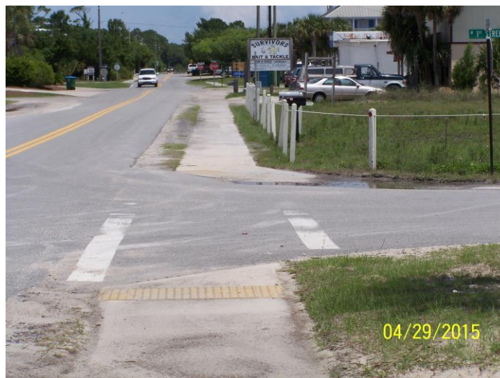
Looking east along West Pine Street from 1 st Street West.

There is a concrete sidewalk on the southeast side of West Pine Street from the east side of Franklin Boulevard to Second Street West, approximately 1,060 feet in length. It was constructed in 2009 by Franklin County with Federal Stimulus funding through the Local Agency Program administered by the Florida Department of Transportation. The sidewalk is 5 feet wide. There are detectable warning surfaces (truncated domes) across the sidewalk at every street intersection. There are no physical barriers that limit accessibility of individuals with disabilities.