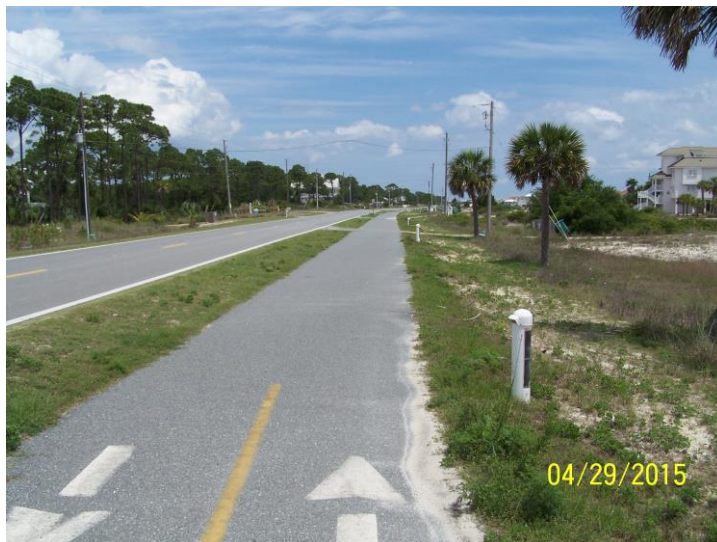
Looking east along the St. George Island Path from 11 th Street East.

There is a concrete sidewalk on the northwest side of East Pine Street from Third Street East to Franklin Boulevard, approximately 1,300 feet in length. It was constructed in 2009 by Franklin County with Federal Stimulus funding through the Local Agency Program administered by the Florida Department of Transportation. The sidewalk is 5 feet wide. There are detectable warning surfaces (truncated domes) across the sidewalk at every street intersection. There are no physical barriers that limit accessibility of individuals with disabilities.