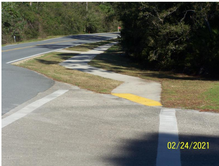
Looking northwest on South Bayshore Drive at the intersection with Las Brisas Drive.