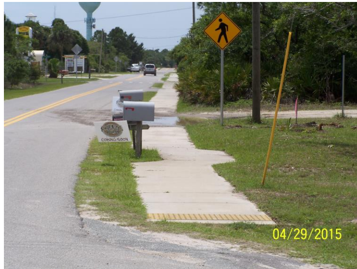
Looking west along East Pine Street from Third Street East.

There is a concrete sidewalk on the southeast side of West Pine Street from the east side of Franklin Boulevard to Second Street West, approximately 1,060 feet in length. It was constructed in 2009 by Franklin County with Federal Stimulus funding through the Local Agency Program administered by the Florida Department of Transportation. The sidewalk is 5 feet wide. There are detectable warning surfaces (truncated domes) across the sidewalk at every street intersection. There are no physical barriers that limit accessibility of individuals with disabilities.