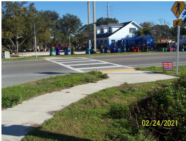
Looking north from South Bayshore Drive at the crosswalk on U.S. Highway 98.

Also in 2018, a 5' wide sidewalk was installed along South Bayshore Drive from U.S. Highway 98 to Island Drive, a distance of approximately 5,400 feet. There are detectable warning surfaces (truncated domes) across the sidewalk at every street intersection. Crosswalks were installed on U.S. Highway 98 and Island Drive to connect this sidewalk with other existing sidewalks. There are no physical barriers that limit accessibility of individuals with disabilities.