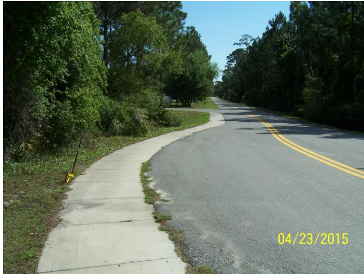
Sidewalk along Ken Cope Avenue, east of Carrabelle, leading to the Will Kendrick Sports Complex.