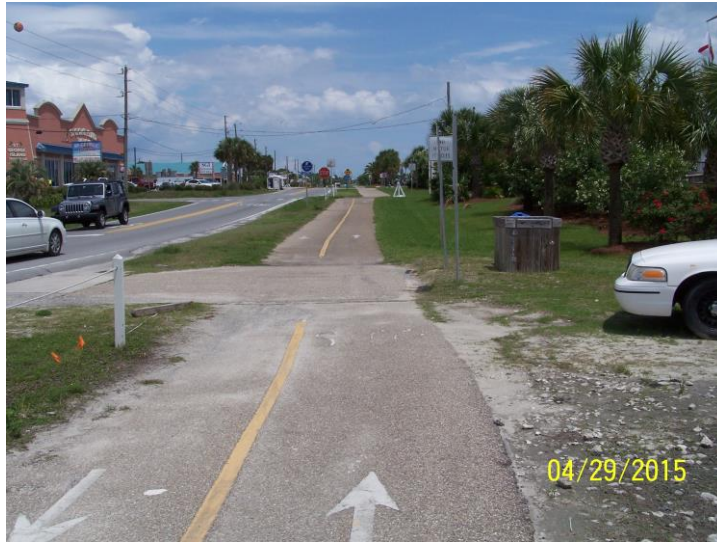
Looking east along the St. George Island Path in the middle of St. George Island at Franklin Boulevard.