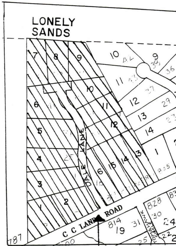
Lots 1-16, Lonely Sands Subdivision, Eastpoint to Be rezoned from R-4 Single Family Home Industry to R-1A Single Family Subdivision